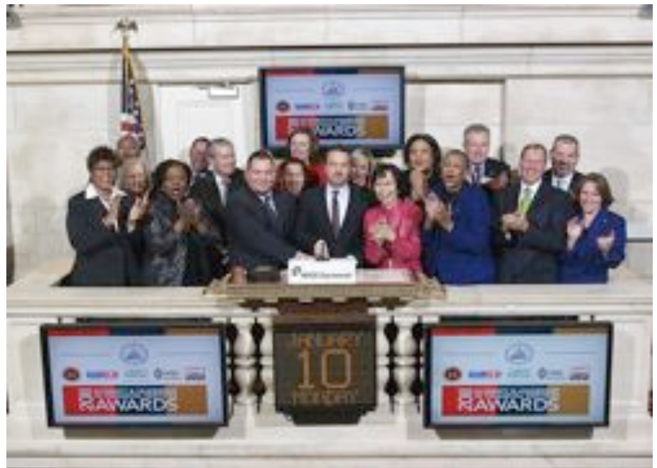
NGLCC Founders, Board of Directors, organizational allies, and corporate partners ring the NYSE Closing Bell at the 2011 Diversity & Leadership in Financial Services Awards. (January 10, 2011)